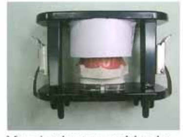
Mounting the stone model to the upper magnetic mounting plate