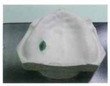
Relief the undercut of the model