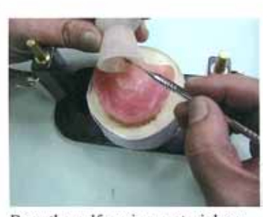
Pour the self-curing material on the tissue surface then lock the left and right latch at the same time