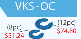
VKS-OC Block out discs 43005400-2.2mm 43006520-1.7mm