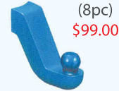
OC Males 43007347 1.7mm, 60°