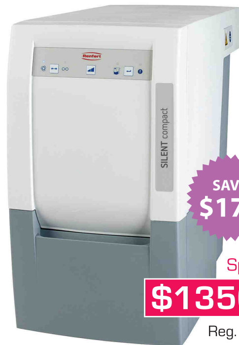
2934-3000 (17.3 x 9.7 x 19.7 inches - 110V)