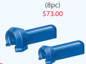
VKS-SG & SV Castable Housings 43006808-2.2mm 43006708-1.7mm