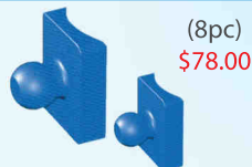
SG Males 43055370-2.2mm 43056700-1.7mm