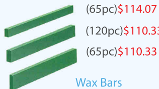
Wax Bars 43002650-1.6x8x50mm 43002660-1.9x4x50mm 43002670-2.2x6x50mm