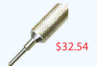
Insertion Pin 43005480-2.2mm 43006210-1.7mm