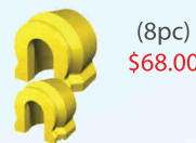
SG Yellow 43005420-2.2mm 43006660-1.7mm