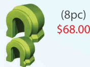
SG Green 43005410-2.2mm 43006680-1.7mm