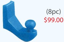
OC Males 43005390 2.2mm, 30°