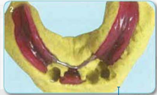
Impression of the actual situation with alginate.