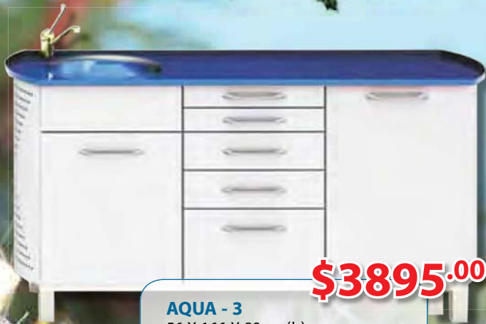
AQUA - 3

56 X 166 X 89cm (h) 19mm glass, built-in sink Waste bin Long lever faucet & pop-up siphon Weight: 150 kg