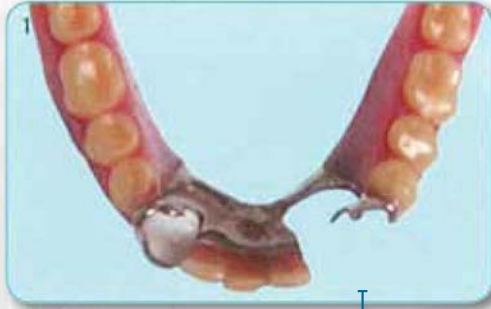
Lower CoCr restoration is "transformed" into a temporary full denture after extracting the abutment teeth.

Qu-resin for intraoral use. The dentist can perform chairside repair of the denture and reduce the amount of time considerably.