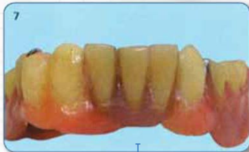
Denture completed with Qu-resin dentin and Qu-resin pink.