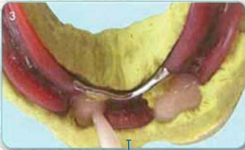
After the extraction of the teeth, the positions of the missing teeth in the impression are filled with Qu-resin.