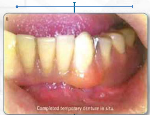
Completed temporary denture in situ.