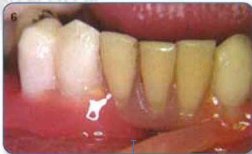
Material can be directly injected below small, non-supported areas in the mouth.