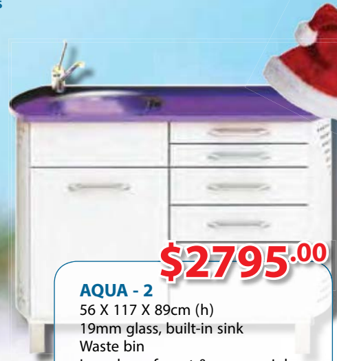
AQUA - 2

56 X 117 X 89cm (h) 19mm glass, built-in sink Waste bin Long lever faucet & pop-up siphon Weight: 100 kg