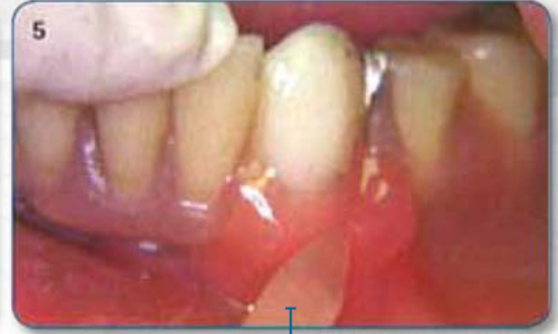
Missing pink-colored areas are filled directly in situ.