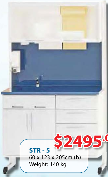
STR - 5