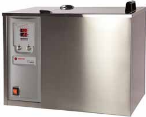
E2 - 080062 LAVA - WASHING AND POLYMERIZING

The "Concept" controls family has been developed as an economical alternative to the Mestra's standard electronic controls. Their performance and features meet perfectly the needs and expectations of most of the users, but at a very appealing price.