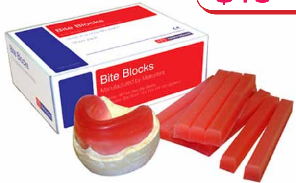
WAXBB48 (48 per pack)