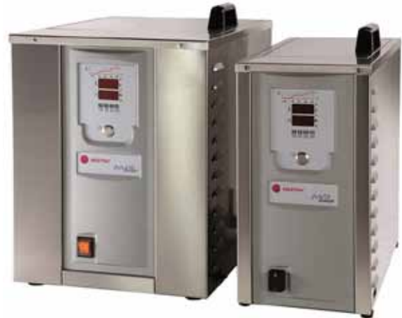
M18 - 080406 POLYMERIZER