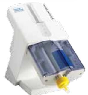
655988 Virtual Mixer