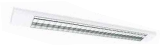
ER-L 02 Ceramist Light