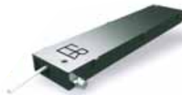
ER-0015 Retractable Mechanism