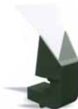
ER-0013 Plastic Attachment